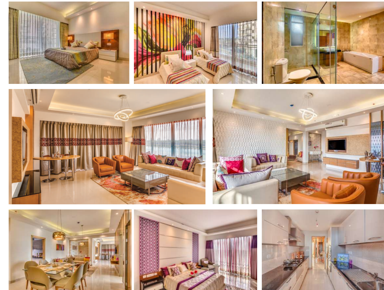
Actual Pic of Meadow Highrise

A Large and luxurious State-of-the-art Clubhouse has been planned with Squash, Billiards, Gymnasium, Swimming Pool, Spa and a large banquet hall to fulfill your family's entertainment needs. For the outdoors, a jogging trail, a cycling track, multipurpose courts, yoga pavilion & children's play area have been specially provided.